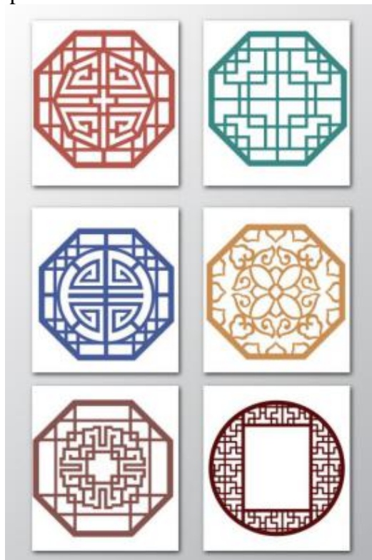
Figure 3 Application of paper-cut elements

One of the representatives of traditional Chinese folk art is paper-cut, paper-cut spread in the folk, at the same time has a broad mass base, in the current process of visual communication design works creation, the need for relevant people to make full use of paper-cutting this cultural form, so as to fully show the national life atmosphere. For paper-cut, it is relatively simple in the process of design and creation, only need a scissors or a piece of paper to complete, through the use of a pair of hands to create a moving and lifelike image, so popular in the folk. In real life, the paper-cut element is an important embodiment to fully show the characteristics of life and the atmosphere of life, the content of the expression originates from life, the application of this traditional element in the process of visual communication design can promote the art works to have a deeper cultural connotation, but also can fully show the unique traditional cultural charm. For example, in the process of packaging food products, usually will use paper-cut elements, through the paper-cut elements can show a strong regional and ethnic, bring people a sense of affinity, but also can catch the attention of consumers, to promote consumer behavior.